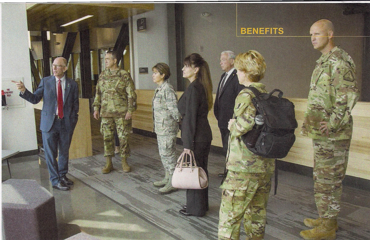
94th Airlift Wing